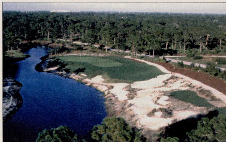
Pete Dye's new course at PGA Village mixes water, sand — and trouble.

When he first walked this 300-acre combination of sand and wetlands, Dye knew his job would be demanding. He was creating a course that had to follow strict environmental guidelines, combine playability with challenge, but also be a showcase to the golf world, since The Dye Course would be part of the PGA of