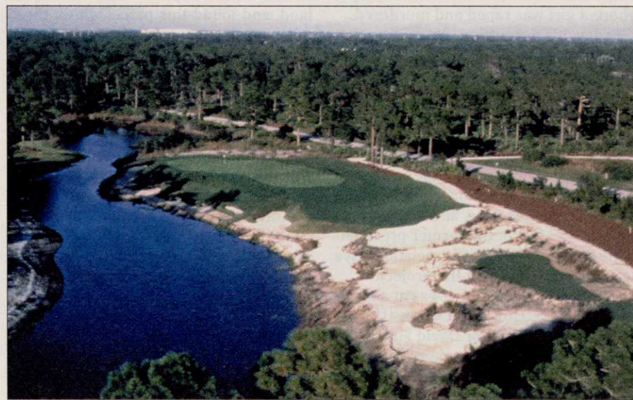
Pete Dye's new course at PGA Village mixes water, sand — and trouble.

When he first walked this 300-acre combination of sand and wetlands, Dye knew his job would be demanding. He was creating a course that had to follow strict environmental guidelines, combine playability with challenge, but also be a showcase to the golf world, since The Dye Course would be part of the PGA of