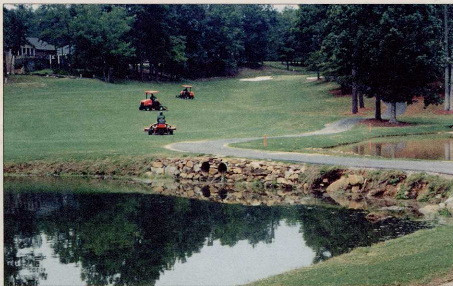
A crew of mowers head out on the Legend Golf Course at StillWaters for a day's work.

He is married and a member of the Georgia, Alabama and national golf course superintendents associations.