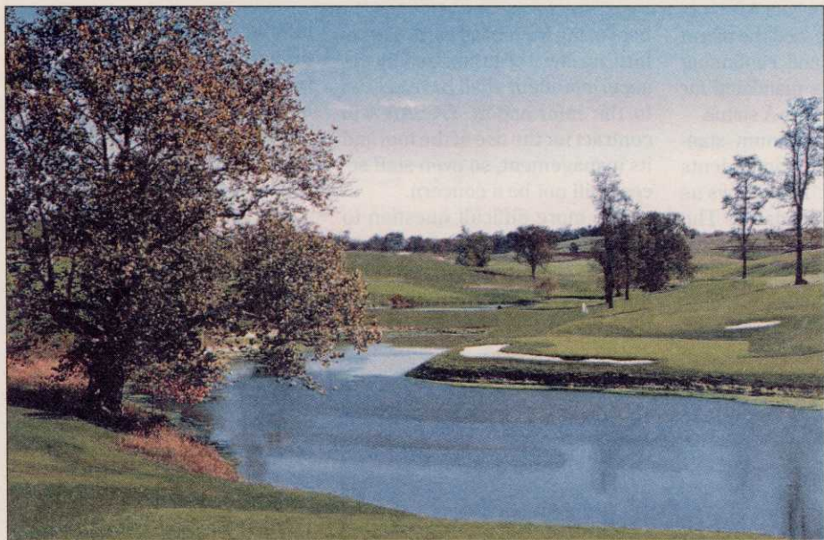
The Bull at Boone's Trace, a GDC course.