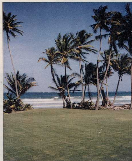
The 14th green at Tobago Plantations

"This site is extremely sensitive environmentally," explained Hunt. "We had to be very careful not to contaminate the mangrove swamps with any run off. The wonderful side effect of this extreme care