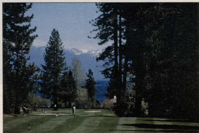
The 8th hole at Old Brockway Golf Club, located on the shores of Lake Tahoe

certification? What sort of benefits did they envision? The answers became clear once operations began to upgrade the 76-year-old course in an area with some of the most stringent environmental controls in the country.