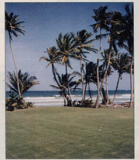
The 14th green at Tobago Plantations

"This site is extremely sensitive environmentally," explained Hunt. "We had to be very careful not to contaminate the mangrove swamps with any run off. The wonderful side effect of this extreme care