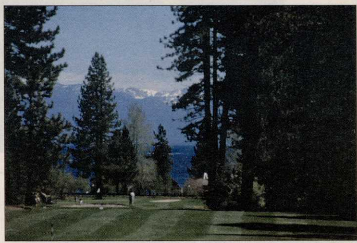
GOLF AND THE ENVIRONMENT

he 8th hole at Old Brockway Golf Club, located on the shores of Lake Tahoe