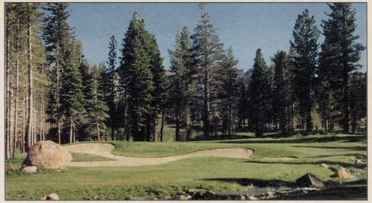
The 8th hole at Sierra Star GC in Mammoth Lakes, Calif., which opened last fall