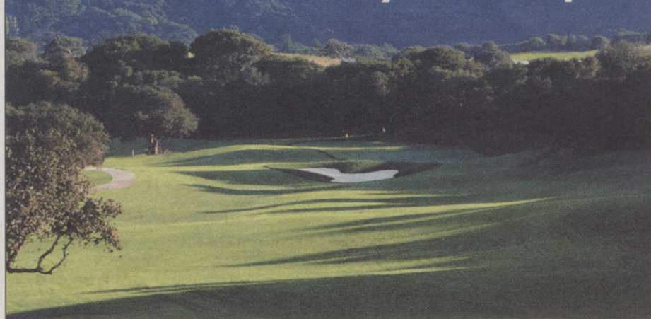
Pasadera Country Club.

egy of the hole and building a creek on No. 18 to accentuate the hole's character and add drama.