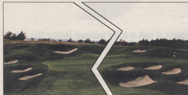
Kansas State University's Colbert Hills Golf Course.

lieve it also sets the standard in other areas: