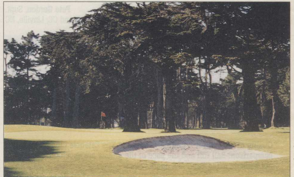
Large trees and classic bunkers are trademarks of Harding Park Golf Course.