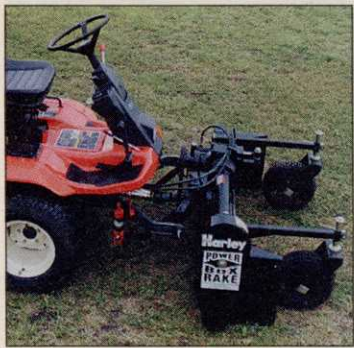
Harley's Power Box Rake