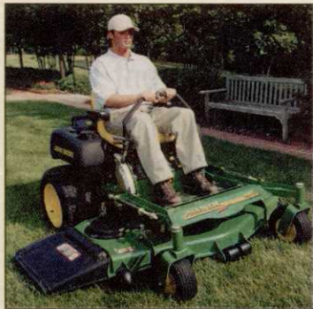
John Deere's new zero-turn Ztrak mower