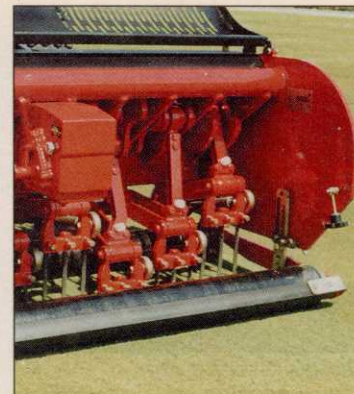
Redexim's Baby Verti-Drain Mustang