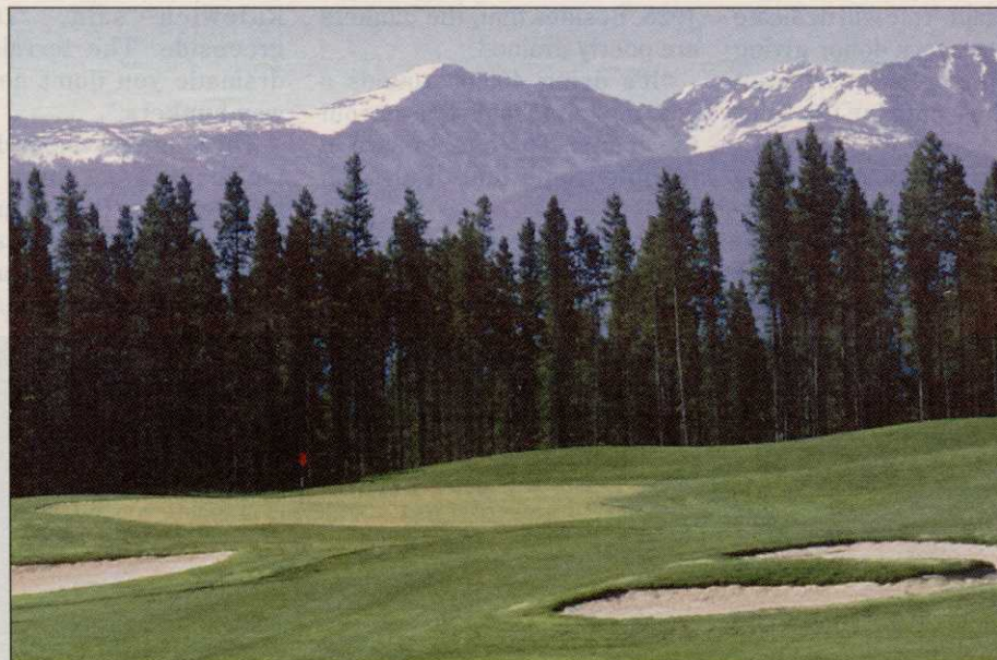
The 8th green on the new nine holes at Pole Creek Golf Club's Ridge Course in Winter Park, Colo.

Griffiths' use of elevation changes and natural land forms make an