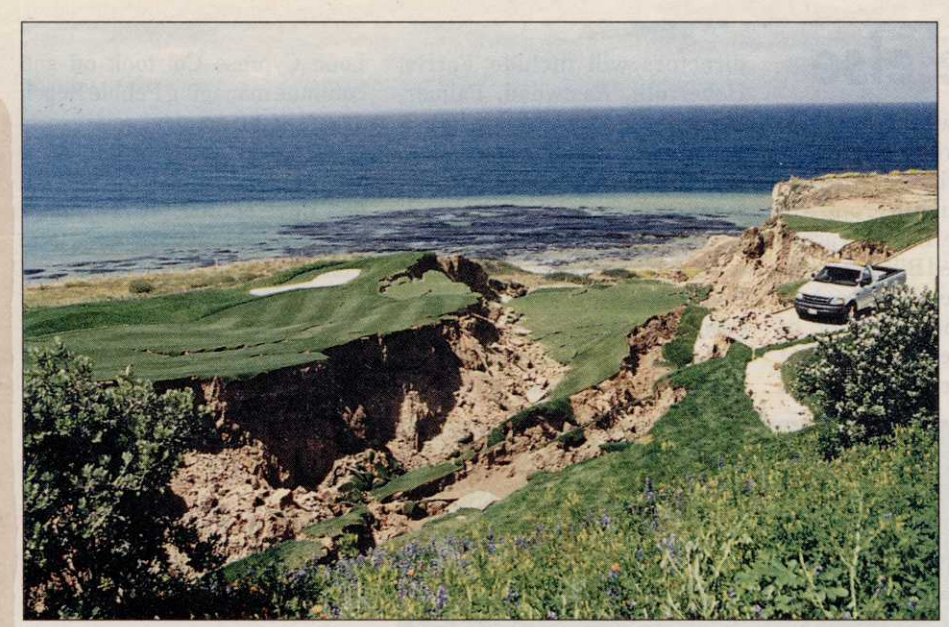
lopers of Ocean Trails Golf Course in Rancho Palos Verdes, Calif., are still seeking a solution to repair the landslide that pushed part of the 18th hole toward the ocean in early June.