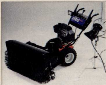
The Ariens Sno-Brush