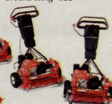
Greens King™ 518