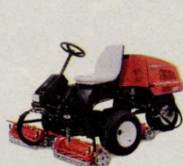
Greens King™ V