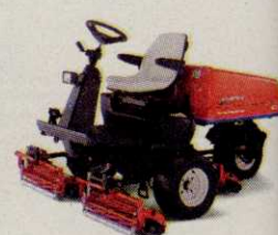
Greens King™ Electric