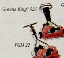
Greens King™ 526