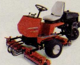
Greens King™ IV