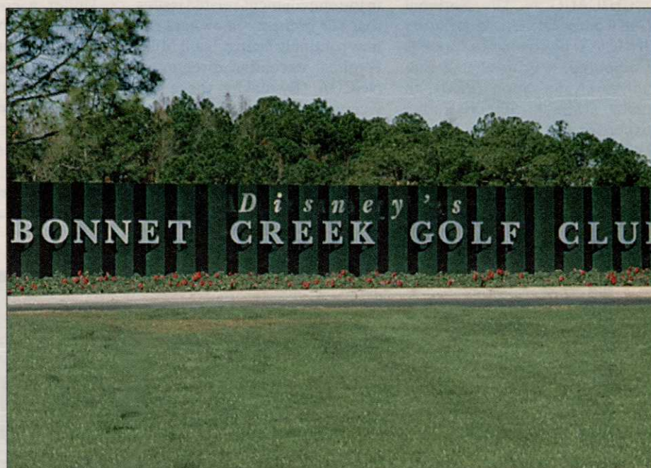
The arrival at Disney's Bonnet Creek Club is announced by a sophisticated sculpture.

As it relates to the course, and those who need to be concerned with its image and presentation, this "prelude" is one of the most essential aspects of golf course image. It may be more important than the logo or course symbol itself. I have visited many courses where neither the name nor logo was especially good, but the experience driving through the gates and eventually finding my way to the first tee was tremendous.