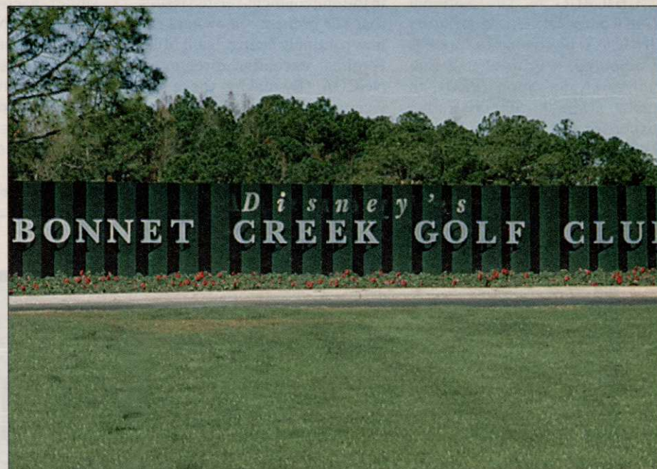
The arrival at Disney's Bonnet Creek Club is announced by a sophisticated sculpture.

As it relates to the course, and those who need to be concerned with its image and presentation, this "prelude" is one of the most essential aspects of golf course image. It may be more important than the logo or course symbol itself. I have visited many courses where neither the name nor logo was especially good, but the experience driving through the gates and eventually finding my way to the first tee was tremendous.