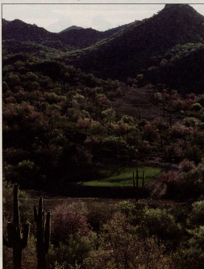
The Rees Jones course at Quintero looks up to the mountains.

Serendipity made this 'private resort' happen for mega-Ford truck dealer