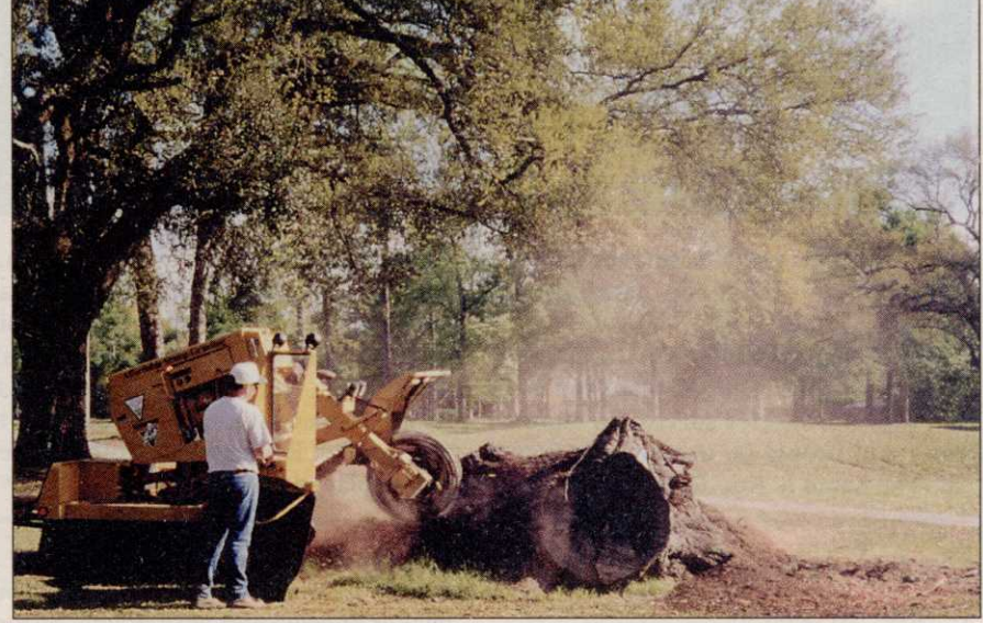
"Have stump grinder will travel..." is the raison d'être of the Crews Service Co.