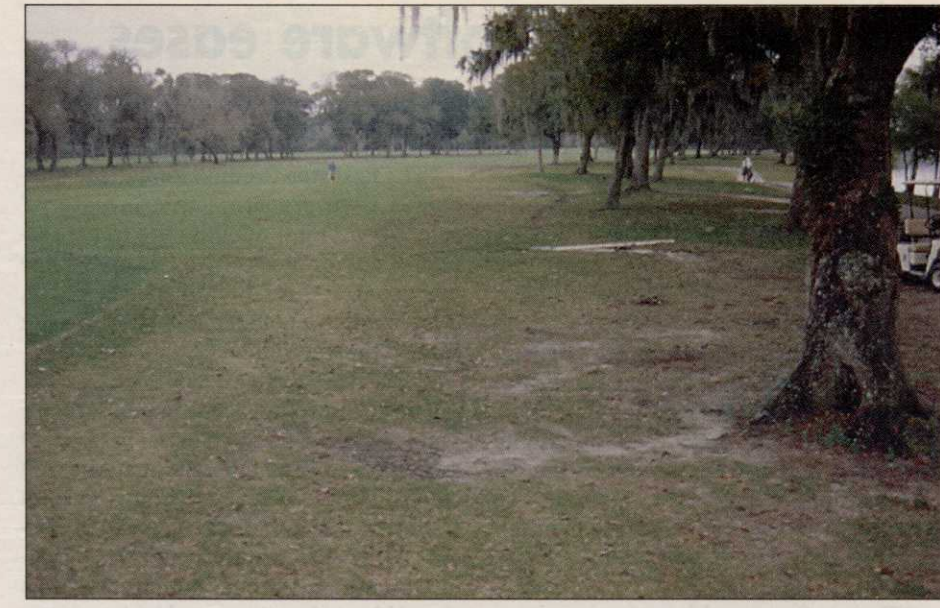
(Above) Roots pruned in 1996 at Riverside CC in Lake Jackson, Texas, show turf in the fairway and less on the tree side. (Below) Workers install a Biobarrier to prevent root encroachment at Riverside.

Removing unnecessary trees as well as pruning will reduce overall moisture losses to trees. Pruning is remedial, though, unless major structural limbs are removed to permanently reduce the tree's