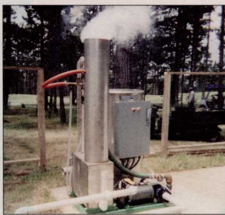
The AquaSO2 generator going full-steam

Webb's team assesses each course individually, performing a water and soil analysis to see what exactly is happening.