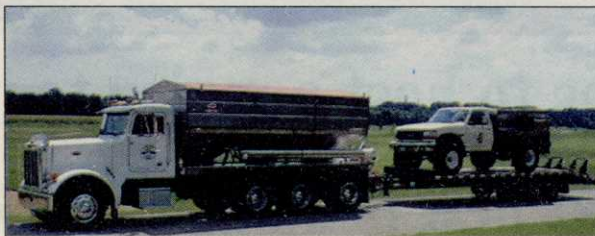
Tyler Enterprises' custom fertilizer application truck in action.