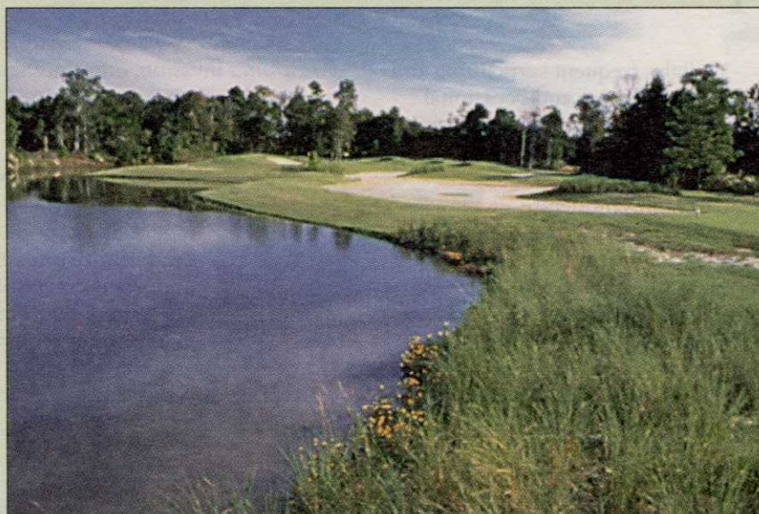
John Daly-designed Wicked Stick in Myrtle Beach, a TSC-managed property.