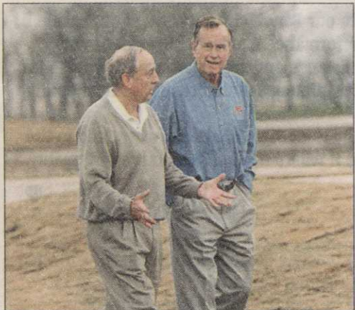
JONES, BUSH TOUR SHADOW HAWK HOUSTON — Rees Jones (left) visited Houston recently to survey the progress of the Shadow Hawk Golf Club and give President George Bush (right) a walking tour of the course Jones is designing for The Redstone Group.

Versatility drives the manufacturer as well as sales among golf superintendents ..... 22