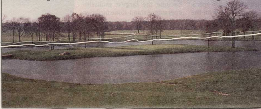
The island hole at Timber Lakes Golf Course presents a tough challenge to finish up the front nine