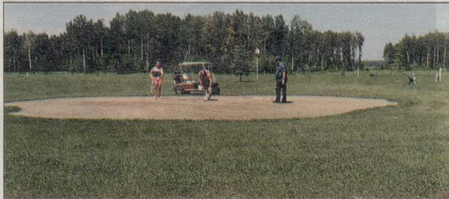
Golfers putt out on the 2nd hole on the Northwest Angle.