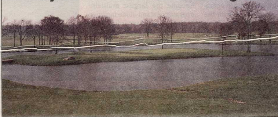
The island hole at Timber Lakes Golf Course presents a tough challenge to finish up the front nine