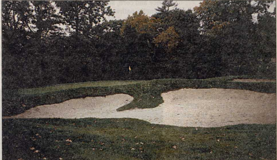
Bill Spence's crews refurbished all the bunkers at The Country Club in Brookline, including this bunker to the right and front of the 16th green.

"As I sit at these meetings, so little about it is golf — it's puzzling some-