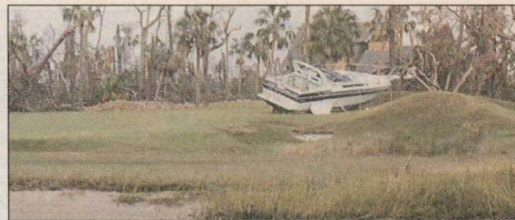
A boat rests on 12th green at Wild Dunes' Harbor Course on Isle of Palms, S.C. following Hurricane Hugo in 1989.

Bloch vows continued support for turf/environmental research.