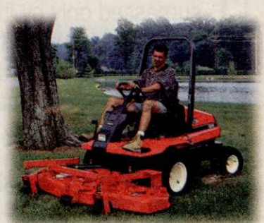
Visiblity and manuverability will increase your productivity.

Available with 60" or 70" side discharge mower or 60" or 72" rear discharge mower.