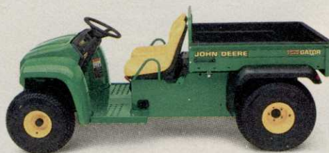
[The New Electric Turf Gator®]

Call us for a test-drive soon. You won't believe your ears. www.deere.com