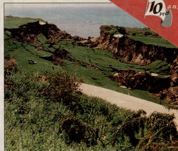
Ocean Trails Golf Course suffers landslide between the 12th and 18th fairways, losing a bulldozer into the chasm.