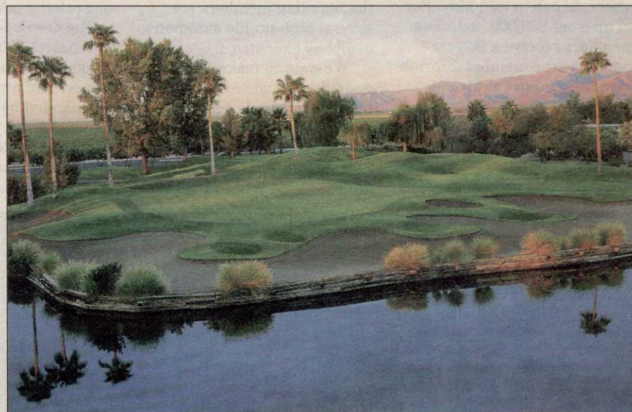
The par-3, 11th hole at Arizona's Great Eagle Golf Club, a MorningStar Golf International property.