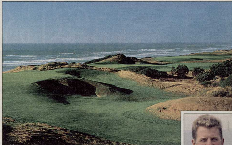
Bandon Dunes was raising golfers' expectations even before it was completed.

"I'd be lying if I said I didn't feel a little pressure [to keep the course maintained in line with the accolades]," Russell added. "We just try to go out and do what we do. As long as they