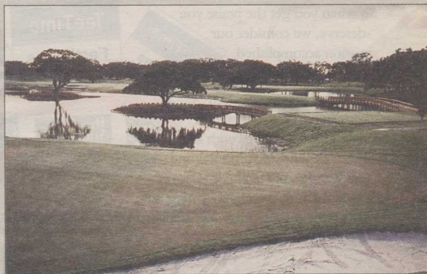
Rolling Hills Golf Club in Davie, Fla., the course where the movie "Caddyshack" was filmed, was recently purchased and renovated by Wayne Huizenga's Florida Panthers Holdings. See story on page 1.