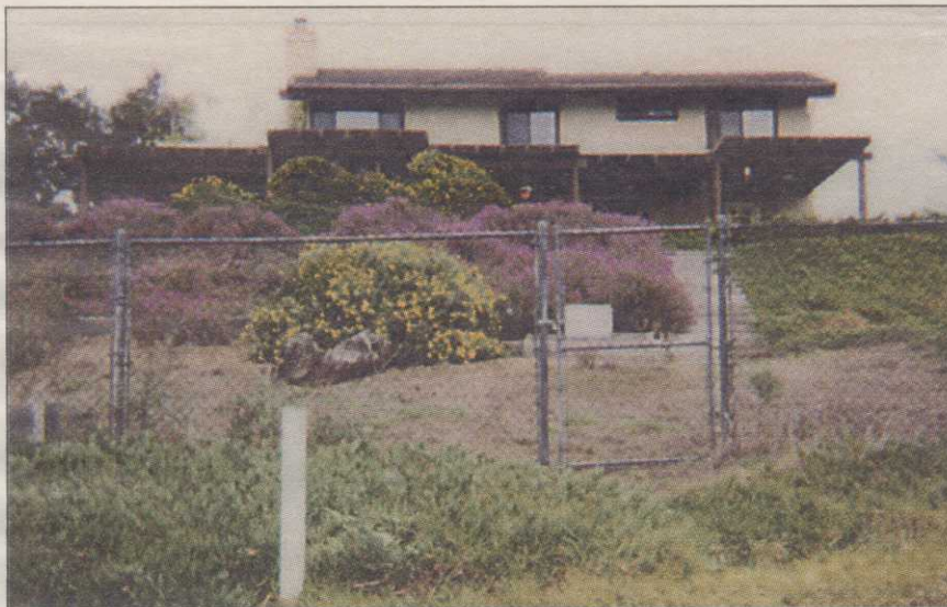
The street address of the house in the background is posted on this out-of-bounds marker at Village CC to help emergency vehicles quickly locate an injured golfer.

"Hopefully, the plan will never be needed. But, if an emergency does occur, the few minutes saved locating the emergency site will minimize the injury."