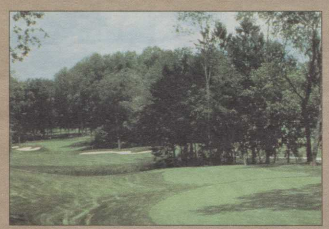
Seed supplied by United Horticultural Supply

Leading superintendents rate Providence the best creeping bentgrass for the northern U.S. and Canada.