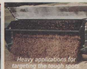
Heavy applications for targeting the tough spots.

Originators Of The First Powered Top Dresser In 1961