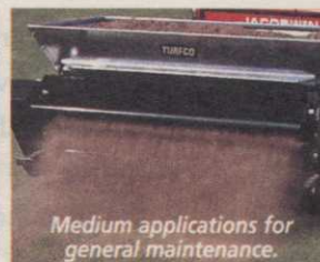
Medium applications for general maintenance.