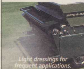
Light dressings for frequent applications.