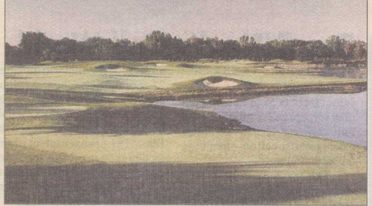
Mistwood Golf Course shows the artistry of architect Raymond Hearn.