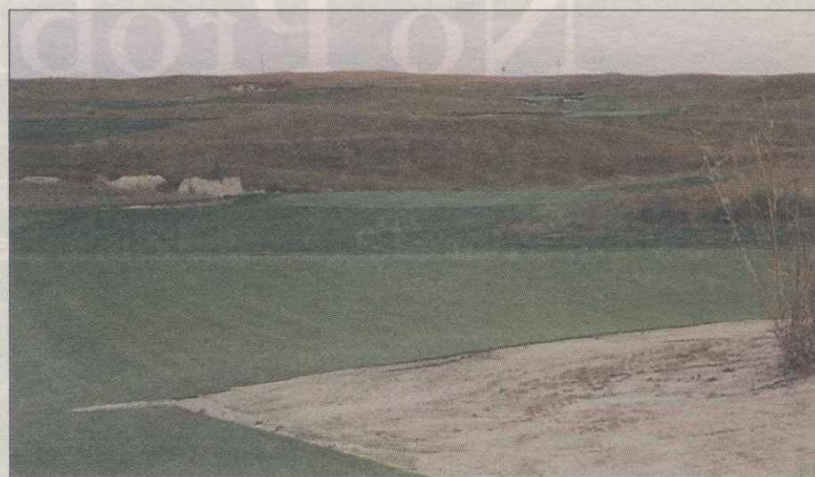
Wild Horse Golf Club forecast to be one of state's best.