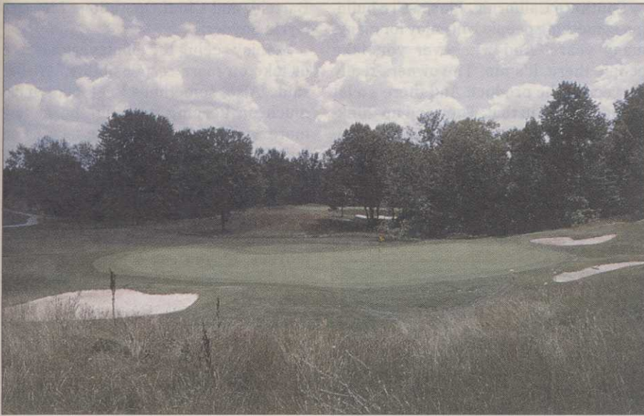
The par-3 2nd at Fieldstone Golf Club, public access track in Auburn Hills, Mich. Art Hills drew it up, Furness made the rest happen. Opened in July, 1998, the course saw 15,000 rounds since.