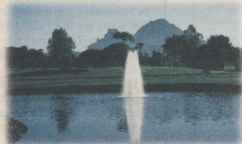
Wide Geyser - 3 HP