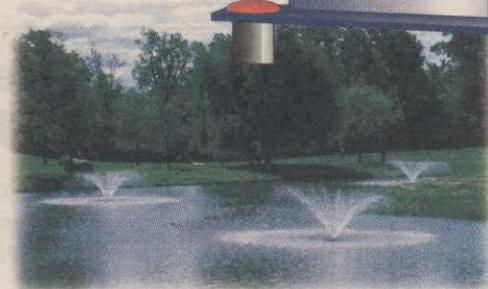
Standard High Volume Flow - 3 Half HP Units