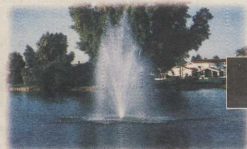
Crystal Geyser - 2 HP