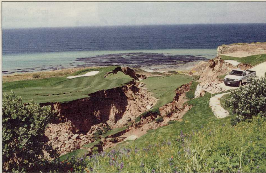
Ocean Trails' 18th hole.

While it's too early to tell, anecdotal information from superintendents and others in the golf industry indicate that, Hurricane Floyd aside, 1999's generally dry weather resulted in greater demands for tee times.