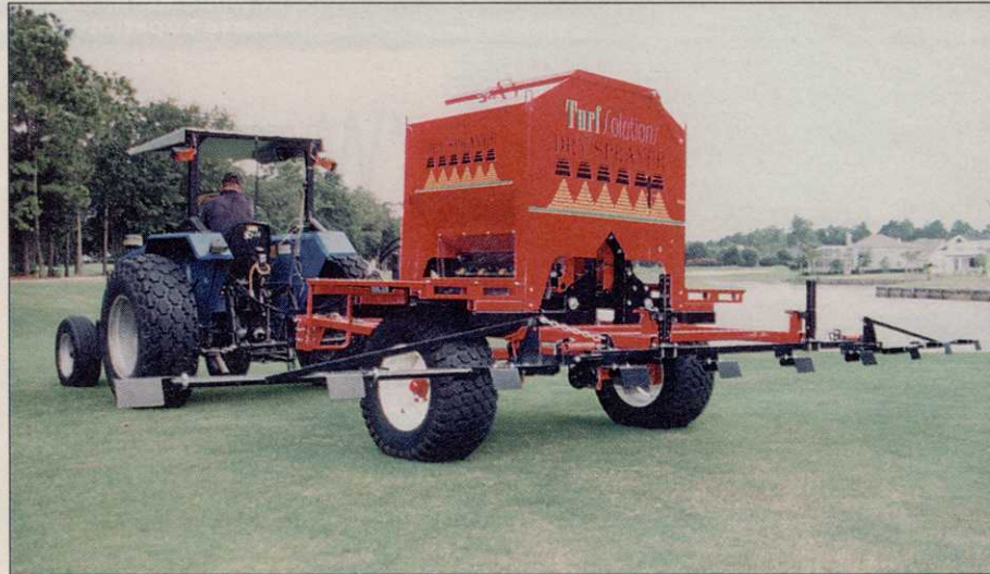
The Dry Sprayer improves seed-soil contact by using air-blast technology to blow seed into the turf canopy.