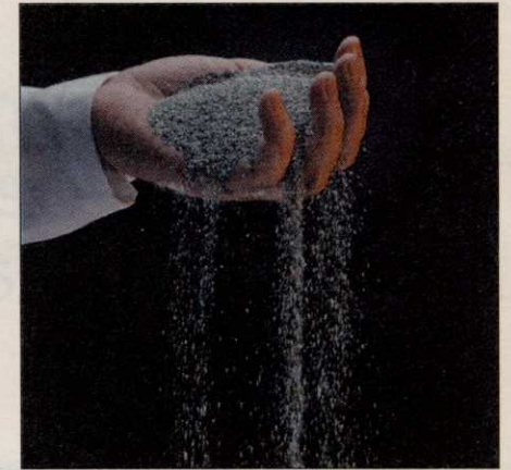
Zinc pellets charge the zinc/air fuel cell.

SAN DIEGO — Metallic Power Ltd. has been awarded a $350,000 contract from the California Energy Commission's South Coast Air Quality Management District to demonstrate a prototype zinc/