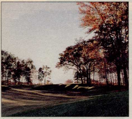
Spring Creek Ranch.