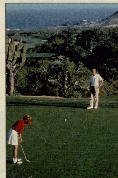
Palmilla, on the Sea of Cortez in Los Cabos, Mexico, is a ClubCorp property.

What are those growth initiatives ClubCorp will pursue?