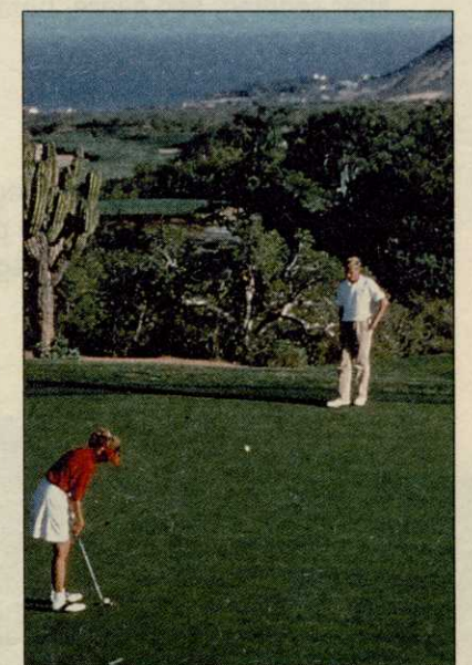
Palmilla, on the Sea of Cortez in Los Cabos, Mexico, is a ClubCorp property.

What are those growth initiatives ClubCorp will pursue?