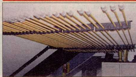
Flagstick storage within easy sight and reach.