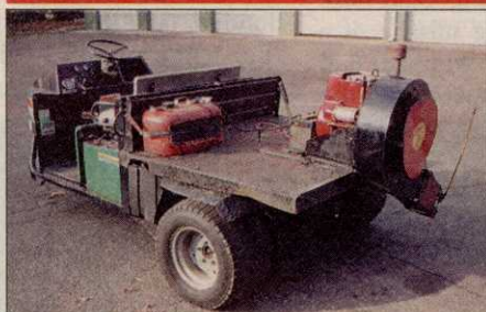
A leaf and debris blower can operate for hours with an auxiliary fuel tank.