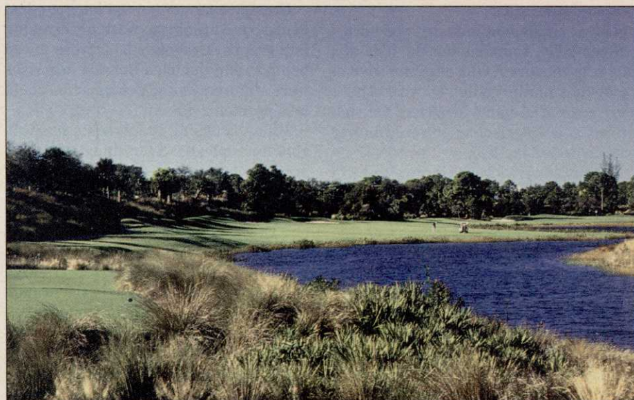
Native plantings shoulder up to the fairway on the 6th hole at Collier's Reserve Golf Course in Naples, Fla.

courses for their contribution to the environment" said Dodson. "Through their positive example, we hope they inspire others to do the same."