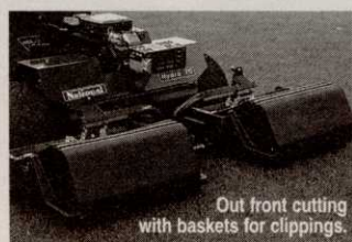
Out front cutting with baskets for clippings.