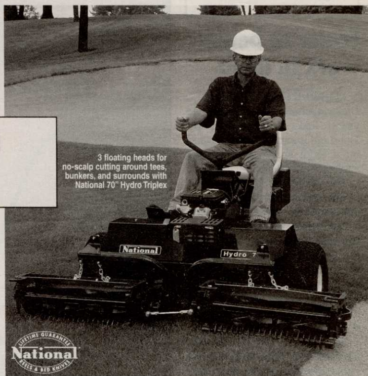
3 floating heads for no-scalp cutting around tees, bunkers, and surrounds with National 70" Hydro Triplex

700 Raymond Avenue • St. Paul, MN 55114 Fax (651) 646-2887 Email sales@nationalmower.com