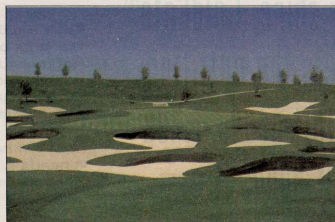
The Links at RiverLakes Ranch, an Environmental Golf facility under construction in Bakersfield, Calif.