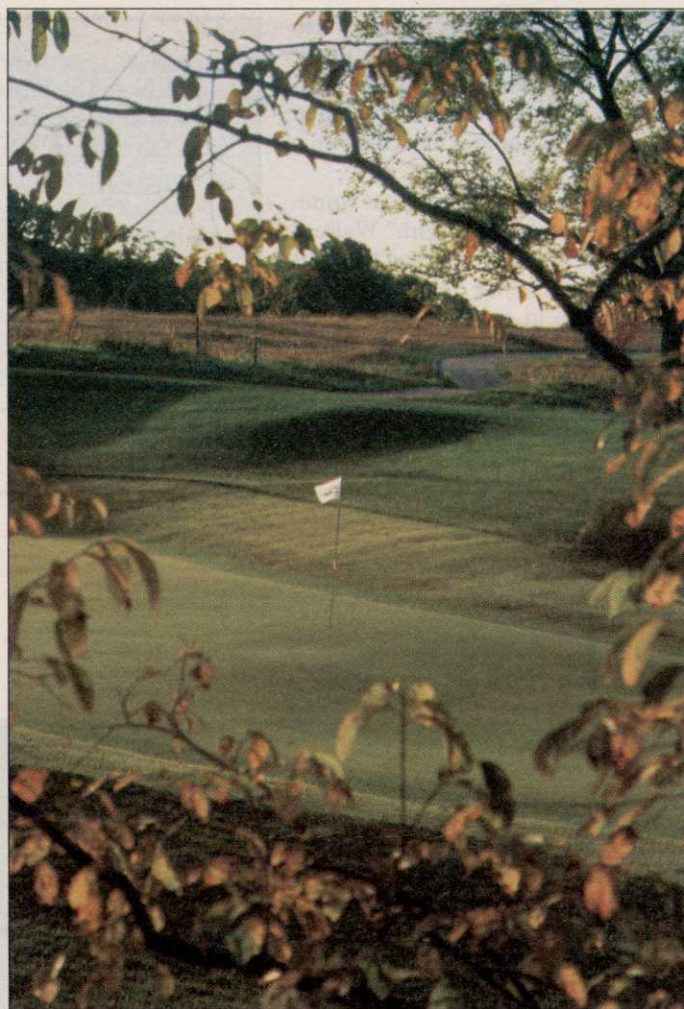
Missouri Bluffs Golf Club, a Walters Management layout in Missouri.