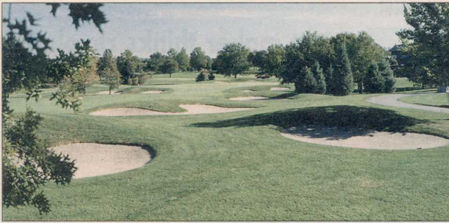
The 18th green at Des Moines Golf and Country Club is one of those renovated.