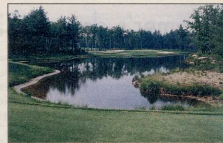
The 17th hole at Dunegrass in Old Orchard Beach, Maine.