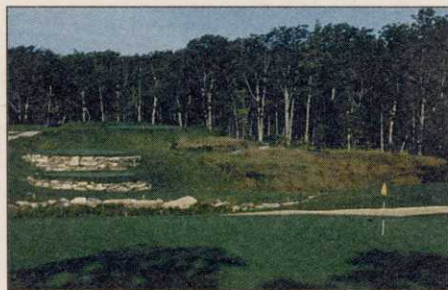
The 5th hole at The Ledges Golf Club in York, Maine.