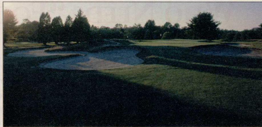
Cape Arundel Golf Club's 18th green complex, with its bunkers and green restored to the way Walter Travis built it nearly 80 years ago.

This abundance of work is keeping course architects, builders and superintendents bustling from East Coast to West. Here we take a look at two particular projects in Maine.