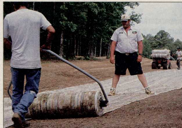
A crew lays down a roll of Z-Net with zoysiagrass implanted in it.

Z-Net, a new patented growing method developed in Japan and brought to America by Winrock