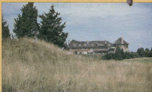
The Misquamicut Club, Rhode Island

So, no matter where you use it or how you cut it, fine fescue is making history — again!