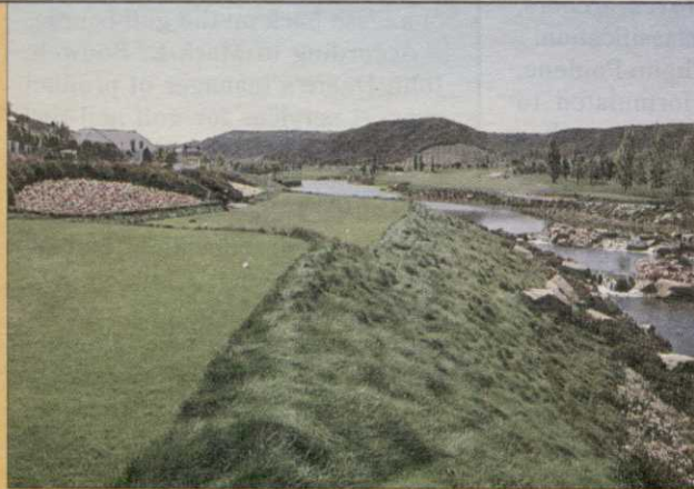
Del Mar CC, California