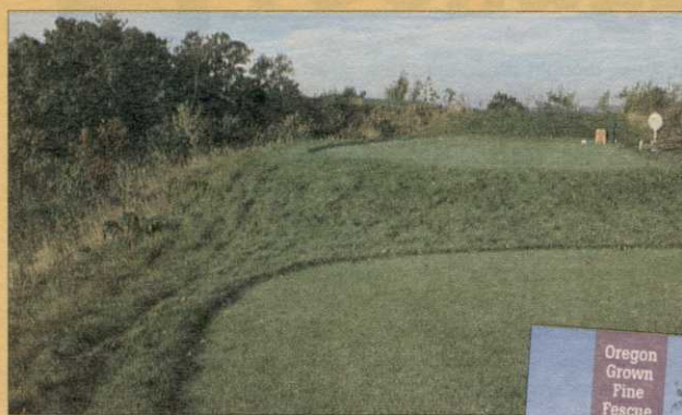
Widow's Walk GC, Massachusetts